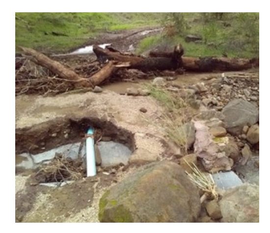
Alegre Creek Crossing

Winter Storm Damage: The storm of January 9<sup>th</sup> to 10<sup>th</sup> dumped approximately 12 inches of rain on Rancho Alegre. The good news is that the new buildings finished and under construction did well with no damage or leaking in upper camp. The sanitation system experienced damage and is out of order and pending repairs. The bulk of the damage done to property was along Alegre and Tequepis Creeks. The Larsen's meadow road has one downed tree and a portion of the road undermined by the Creek. The Bridge to Larsen's Meadow did survive the large debris flow but the creek took an unexpected turn and went around the bridge leaving that entrance unusable. Both creek crossings at Alegre Creek were damaged and currently unusable. All roads will need some repair. The camp is currently closed until we can make it safe for use again.