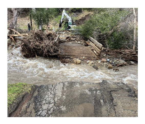
Larsen's Meadow Bridge

Dorm three is under construction! The Los Padres Council is moving forward with construction of the new camp dorms and is working with Frank Schipper Construction to bring dorm three into a usable building. The Council is committed to opening the Outdoor School on a limited basis in Fall of 2023. More buildings will be made available through the spring.